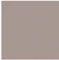
Painted metal Mat dove grey