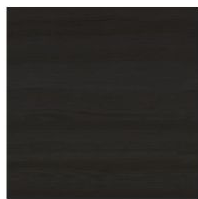
Solid wood Coal ash