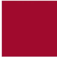
Painted metal Mat red