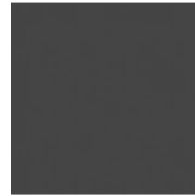
Painted metal Supreme anthracite