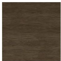
Solid wood Walnut painted ash