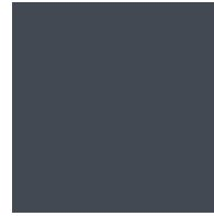
Polypropylene Mat anthracite grey