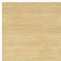
Solid wood Natural ash