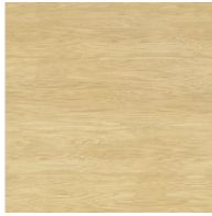
Solid wood Natural ash