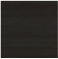
Solid wood Coal ash