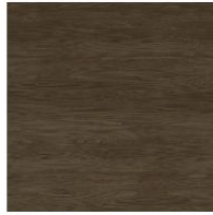
Solid wood Walnut painted ash