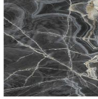
Glossy ceramic Black Onyx