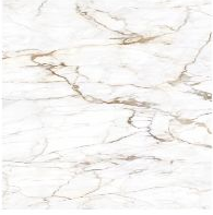
Silk finish ceramic Calacatta macchia vecchia