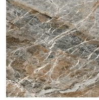
Glossy ceramic Mountain peak