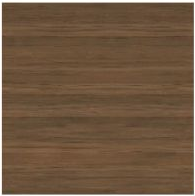
Veneered wood Walnut Canaletto