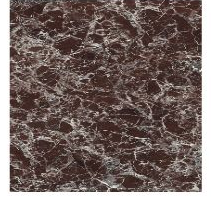
Glossy ceramic Rosso imperiale