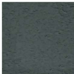
Tempered cast glass Smoked