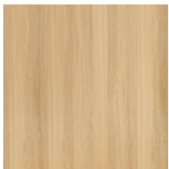
Solid wood Natural ash