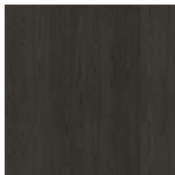
Solid wood Coal ash