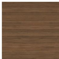
Solid wood Walnut Canaletto

Materials, fabrics, leathers, colors and finishes are approximate and may slightly differ from actual ones. You can find the complete collection of Bonaldo fabrics and leathers on the website https://www.bonaldo.biz/