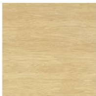
Solid wood Natural ash