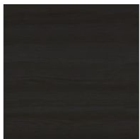
Solid wood Coal ash