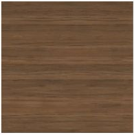
Veneered wood Walnut Canaletto