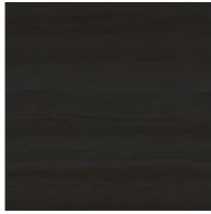
Veneered wood Coal ash