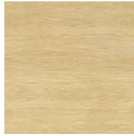
Veneered wood Natural ash