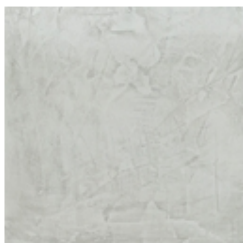
Concrete Travertin look