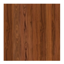
Solid wood American walnut