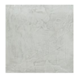
Concrete Travertin look