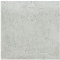
Concrete Travertin look