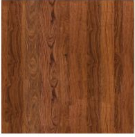
Solid wood American walnut