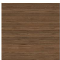
Veneered wood Walnut Canaletto