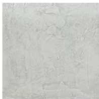
Concrete Travertin look