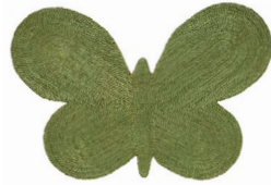
Butterfly Jute Moss