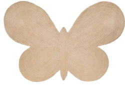
Butterfly Jute Natural