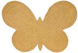
Butterfly Jute Ochre