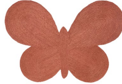
Butterfly Jute Terracotta