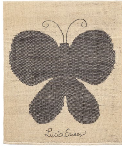
Lucia Eames Tapestry Butterfly